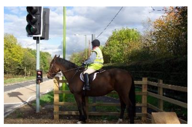
Figure 7 Example of a pegasus crossing

Pegasus crossings are similar to Toucan crossings but have a separate corralled area with a higher mounted red / green horse symbol and push buttons to allow horse riders to cross.