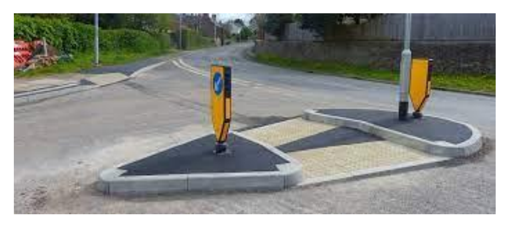
Figure 2 Example of a dropped kerb with a pedestrian refuge

A dropped kerb with a pedestrian refuge is considered where the road width exceeds 10 metres. It provides a refuge for pedestrians and cyclists and narrows the carriageway, which may also reduce speed of traffic.