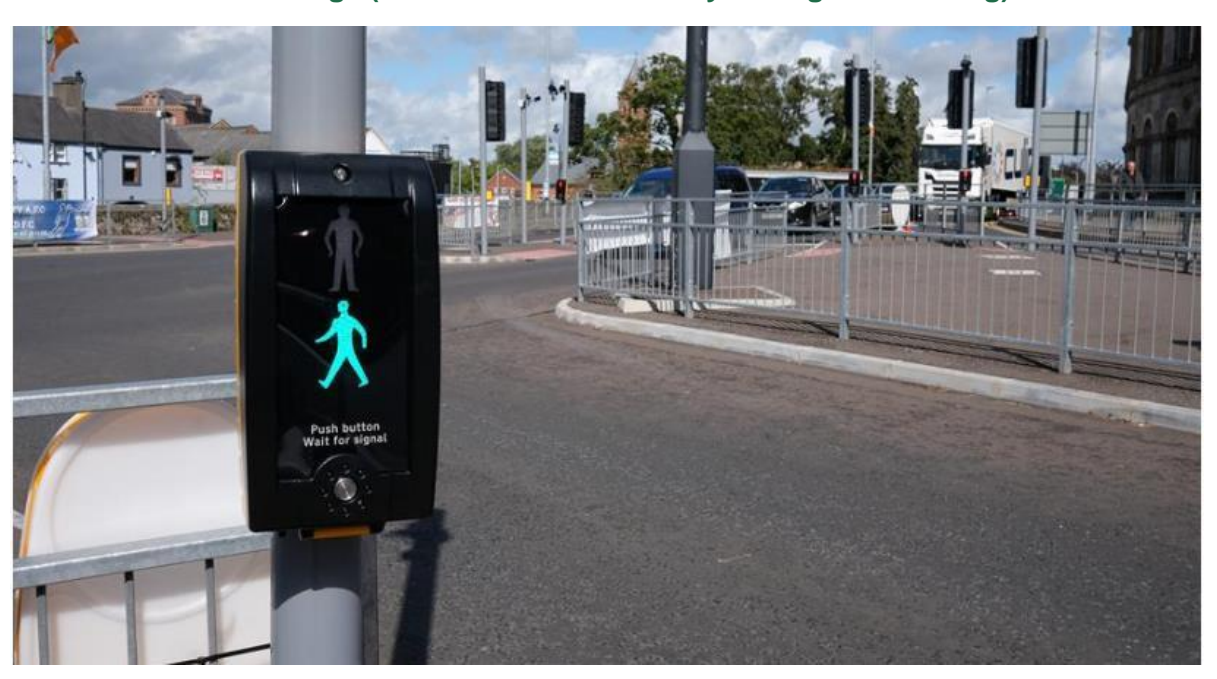
Figure 5- Example of a Puffin Crossing

Puffin crossings can take account of the overall crossing time, which is established each time by on crossing pedestrian detectors. The green person signal only represents an invitation to cross and is followed by an adjustable 'all red period'. This period is determined by the on-crossing pedestrian detectors and is extended sufficiently to allow a pedestrian to safely cross the carriageway.