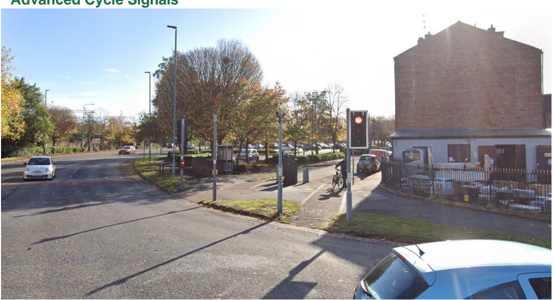
Figure 9- Example of Advanced cycle signals

These are used to connect cycle routes across or through junctions. The distinguishing feature is the use of detectors which differentiate for cyclists at an advanced stop line.