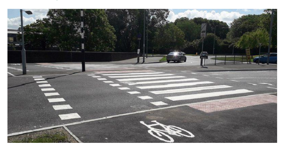
Figure 4- Example of a parallel crossing

Parallel crossings operate similarly to zebras. However, they also include the provision for cyclists to cross without having to dismount. The parallel crossing consists of a standard zebra crossing as above. However, an adjacent area to the zebra is marked with a broken white line for cyclists to cross to provide a continuous route for cyclists.