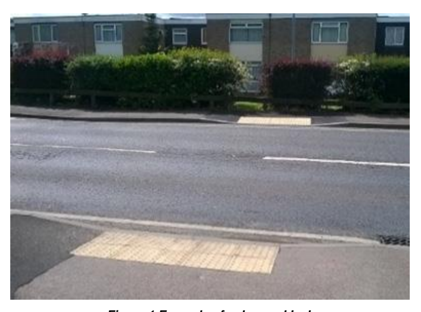
Figure 1 Example of a dropped kerb

Dropped kerbs are used in low-traffic areas to support pedestrian routes.