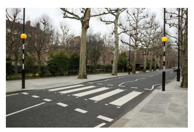
Figure 3 Example of a zebra crossing

Zebra crossings are usually considered where pedestrian flows are relatively low and traffic flows are no more than moderate, as well as considering wider context and design factors.